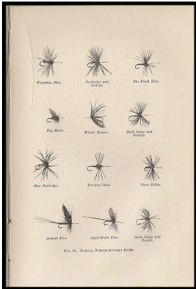
Plate from Bickerdyke's "Angling for Gamefish" 1889, showing Hackle Length and Trimmed Hackles.

This black and white plate clearly shows that not only were hackle lengths much longer during the 19th Century but also that trimming hackles to length was a common and accepted practice.