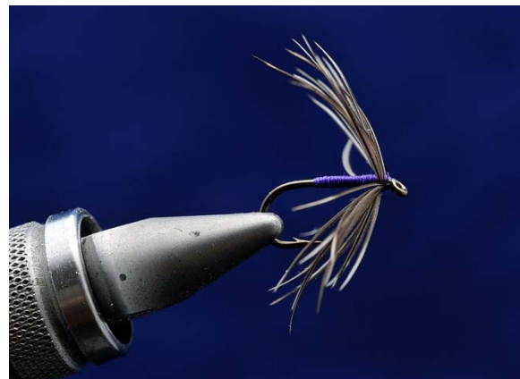
Snipe & Purple

Partridge & Orange: (Dark & Light) Size 14 & 16 Body: Pearsall's #19 Hot Orange (Dark) or #6A Orange (Light), fine gold wire rib. Hackle: Brown Partridge Back.