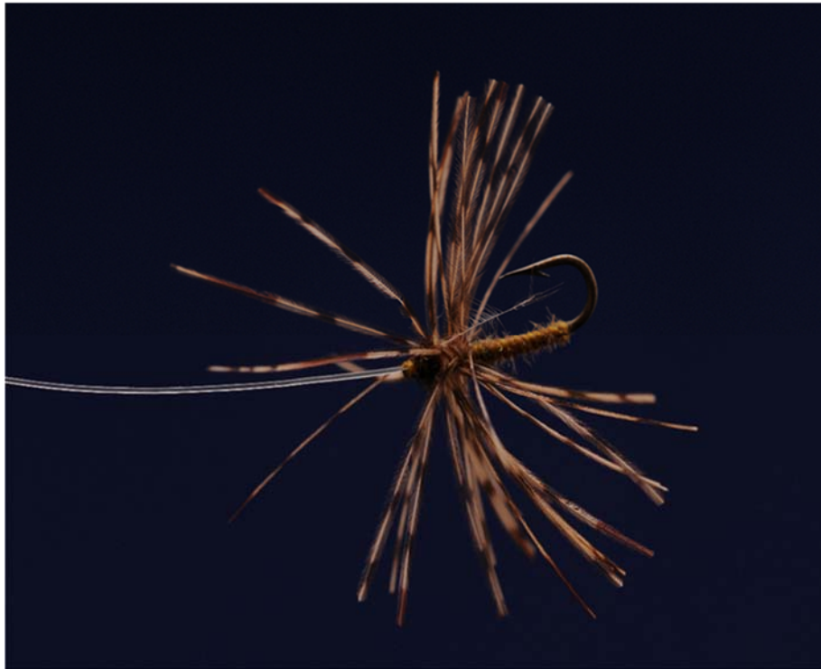
An original Partridge and Orange, circa 1880, showing a trimmed hackle

Hackle length can be manipulated during tying, but I feel strongly about using some of the suggested ways to shorten hackle shown in several contemporary books, and I have never had very good luck using these techniques. You may get the hackle length you want but at the expense of losing the mobility of the hackle fibers, which I feel is so important to effective Spider flies.