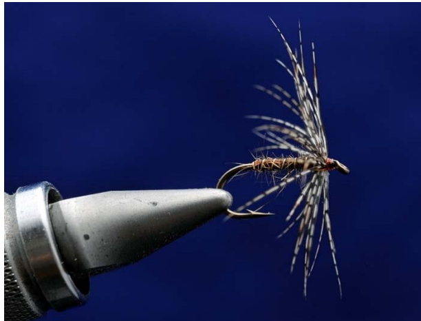
Partridge & Hare's Ear

Snipe & Purple: Size 16 Body: Pearsall's #8 Purple. Hackle: Snipe Wing Covert Feather.