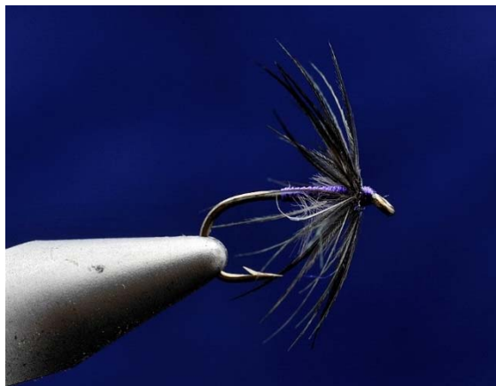
Starling & Purple

Snipe & Purple: Size 16 Body: Pearsall's #8 Purple. Hackle: Snipe Wing Covert Feather.