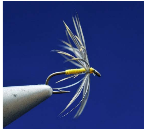
Plover & Yellow

Starling & Purple: Size 16 -20 Body: Pearsall's #8 Purple. (A thorax of either Mole Fur or Peacock Herl can be added if desired. Hackle: Glossy Starling Body Feather.